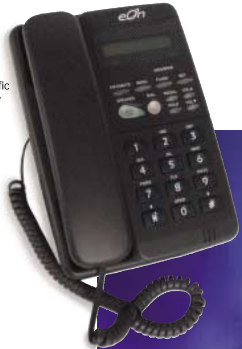
eOn's fully-featured SIP phone can be used in ACD or PBX applications.

With eOn's Supervisor WorkSpace™, contact center managers can monitor and track remote agent activities in real-time, just as if the agents were in the contact center.